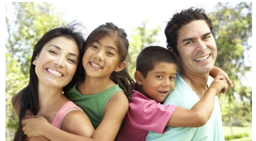
Business Succession Planning