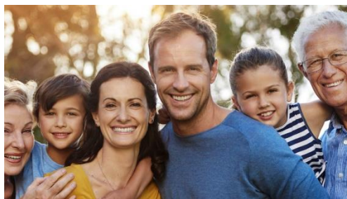
Life and Disability