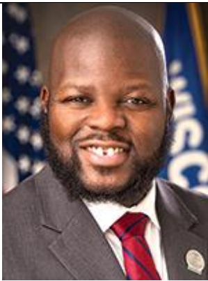
Rep. Supreme Moore Okomunde - D District 17