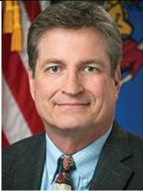
Senator Tim Carpenter- D