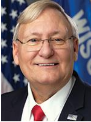
Senator Van Wanggaard - R District 21