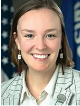
Rep. Greta Neubauer – D District 66