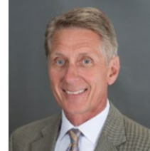
Marlin Greenfield Festival Foods